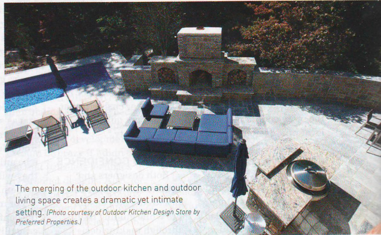
The merging of the outdoor kitchen and outdoor living space creates a dramatic yet intimate setting.

"This design installation is a prime example of how consumers are looking to live beyond the walls of interior spaces," Gotowala said. "I envisioned