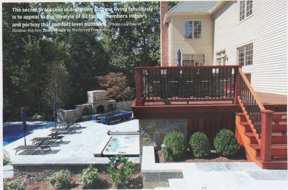
The secret to success in designing outdoor living fabulously is to appeal to the lifestyle of all family members indoors and portray that comfort level outdoors.

For more information about the Outdoor Kitchen Design