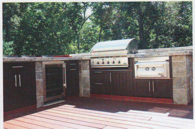
Brown Jordan Outdoor Kitchens' stainless steel cabinetry enhances the beauty and functionality of this architecturally styled outdoor kitchen.