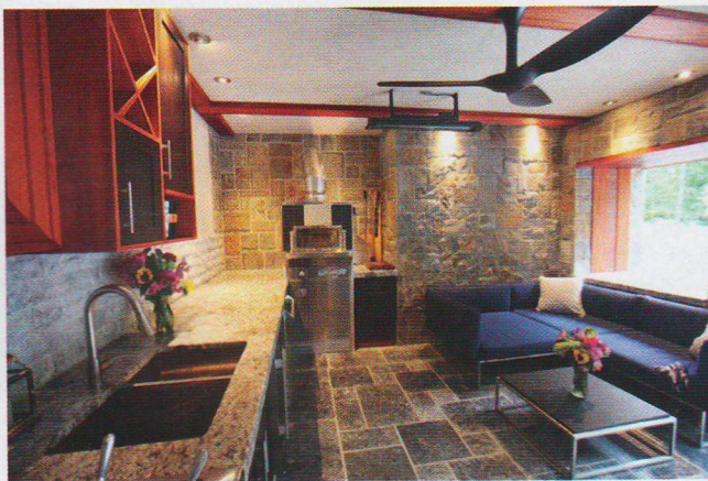
The outdoor room becomes a "great" outdoor room when equipped for all four seasons, both day and night.